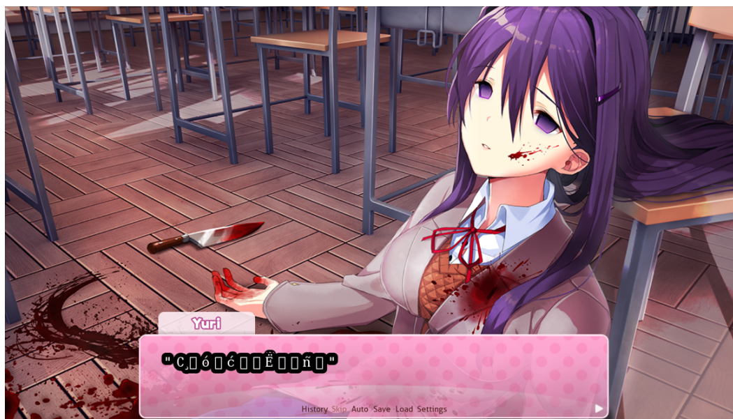
Figure 4 – During the weekend with Yuri, her blood will darken. She also continues to “speak” to the player.

Players are aware that time is passing because of the cycling of light and dark and the discoloration of her body as time passes. Her blood goes from a striking highlighter red to a warm, purplish black. The entire time, a dialogue box appears from Yuri, but the text is gibberish. Opening the dialogue history feature in the menu reveals text from the game’s website, inviting players to the club. Soon it repeats the phrase: “will you promise to spend the most time with me?” as players try different tactics to proceed through this arduous weekend. (Fig. 5) I continued to click through the dialogue for nearly twenty minutes. The more time passed, the more nervous I grew. Eager to find a solution to the seemingly endless dialogue, I opted for the “skip” button to accelerate my way through the weekend after realizing that time was passing in game. Other players tried exiting and restarting the game, only to return to the weekend with Yuri.