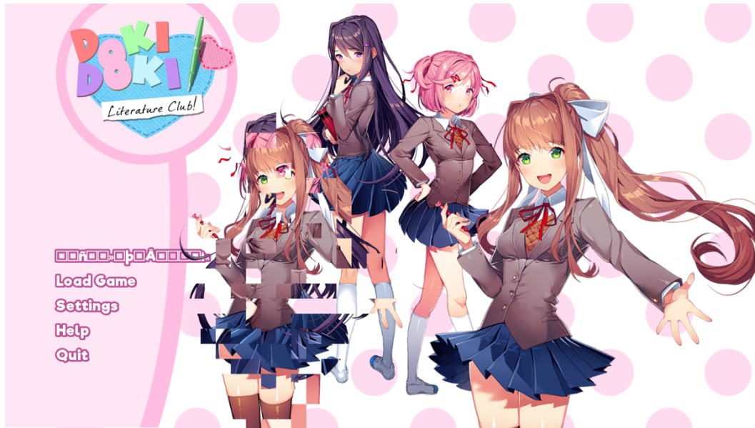
Figure 2 – The title screen after Sayori’s death. Her figure is completely covered by pieces of the other girls.

and the new game bears no mention of her role in the story. (Fig. 2) Her death dissolves any illusion that this game is a Bishōjo, and the restarting of the game is the first time that the setting on the player’s computer becomes apparent.