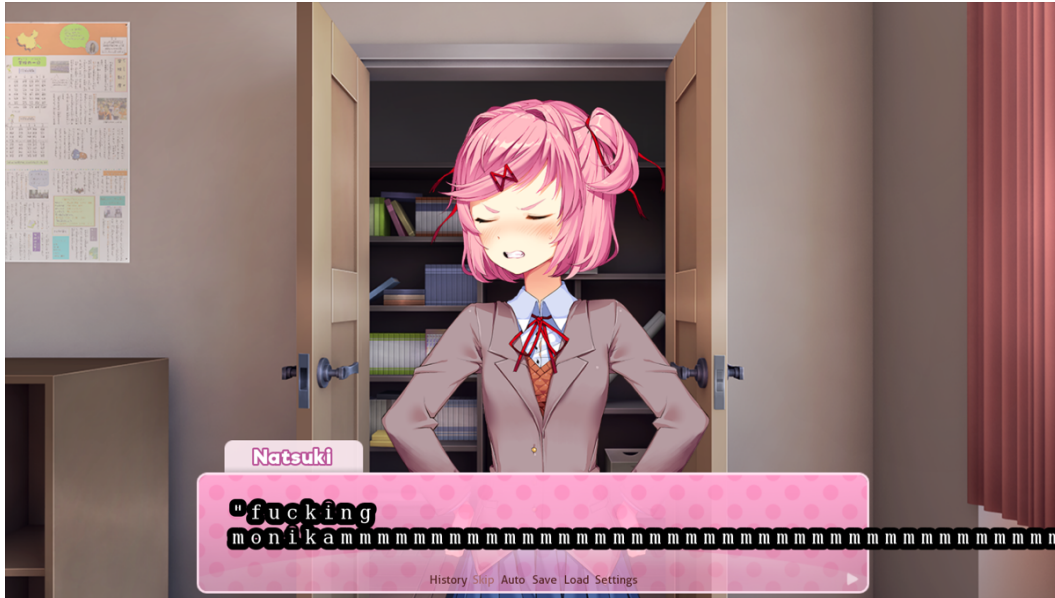
Figure 3 – An example of “Monika Text” overwriting what the other girl is trying to say. Note that it escapes the confines of the textbox.

In these moments, the girls are often warning the player that something is wrong and asking for help. Of course, lack of agency is its own kind of violence. Other times, Monika will appear in front of the text box, breaking the fourth wall. But most often, her “glitches” rely on violence or utilize violent memories.