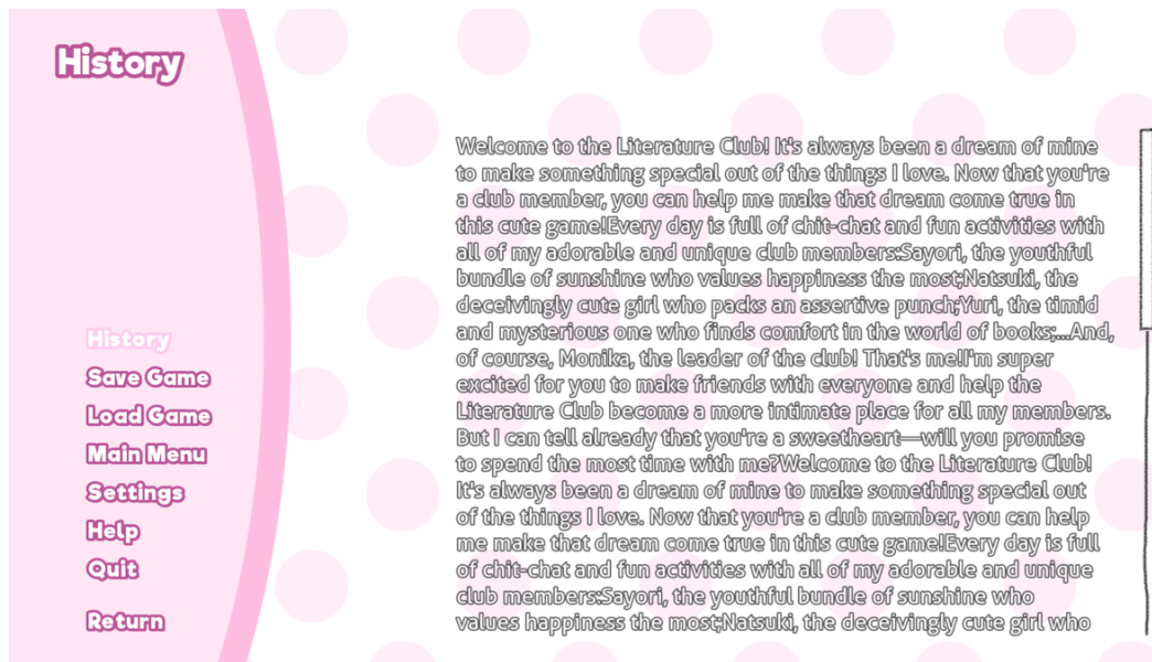
Figure 5 – During the weekend with Yuri, checking the text log in the pause menu shows text from the game’s website.