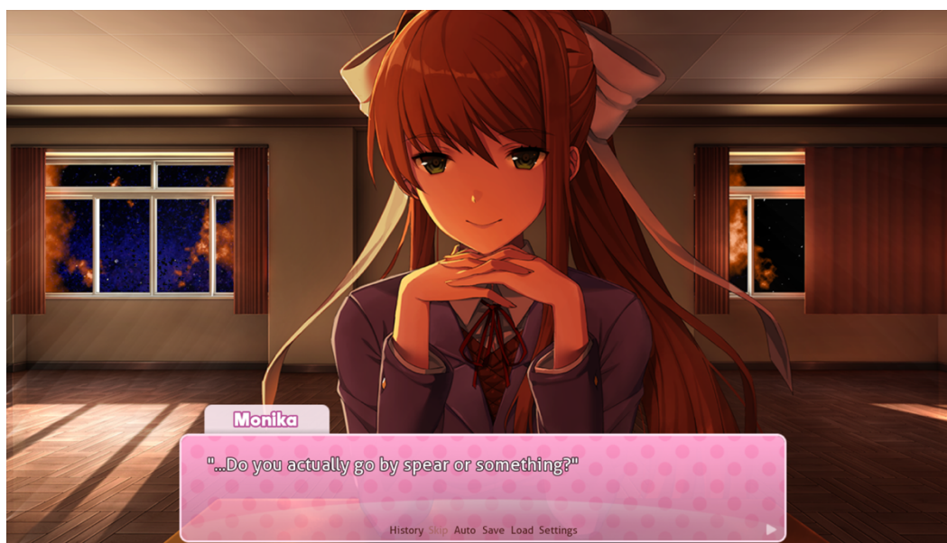
Figure 6 – Monika incorrectly guessing my name after she's deleted everyone and everything else in the game.

In the penultimate scene, after Monika has deleted every other character in the game, she then uses information on the player's PC to find their real name. For players like me, she uses the information shared via a Steam account, which I agreed to when I downloaded the game. She confronts the player about their identity and then presents the player's name as it exists in their computer. 18 The game gazes back at the player. This weird conversation with Monika can go on for hours. (Fig. 6) She cycles through numerous conversations on different topics. For some, the game stops here. As opposed to traditional games that can be beaten through in-game action, DDLC cannot.