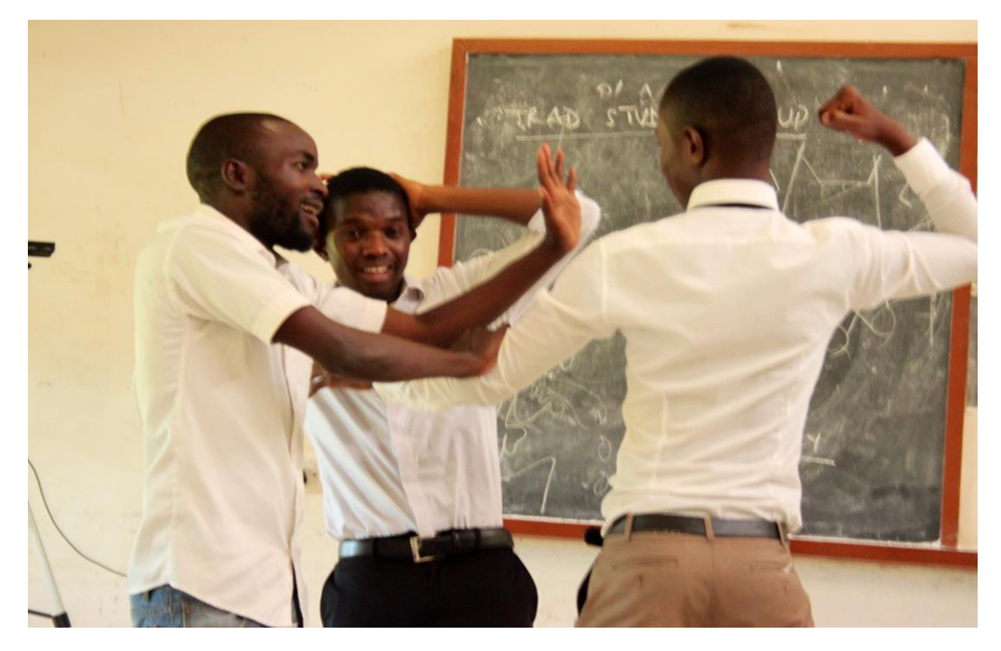
Figure 2 - Participants at Chancellor enact a caring and protective masculinity using Image theatre.

The next step required participants to change the image, and to do so by removing the oppression. When asked what strategies the man could use to overcome his problem, participants suggested that he could find another woman. When the image was changed, the man was seen carrying bags of groceries. The participants said that without providing for a home, the man will not have access to the woman. In my observation, the root problem was that sex was being seen as a financial transaction. In response to this, I set up a final stage that involved creating an alternative image: one that demonstrated ways in which a man without money might claim his "manliness." These new images displayed men as protectors and caretakers of their girlfriends. The construction of an alternative "positive" masculine gender attribute was a significant step forward for the participants, given the retrogressive ideas of masculinity that kept emerging.