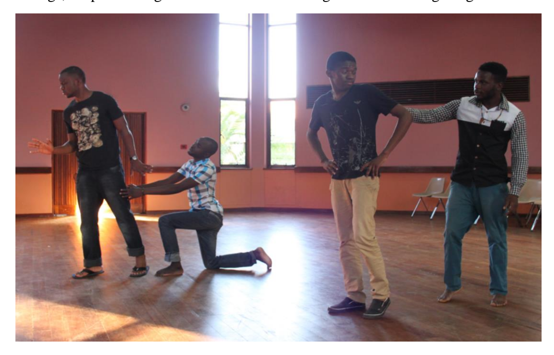
Figure 3 - Participants exploring sexual consent using image theatre

I then asked the group to examine the power dynamics of the couple in order to see if there truly was equality. One of the images made illustrated a man and woman looking at each other, with their arms across each others' shoulders. One participant stated that the image suggested that the man and woman were willing to compromise on things, despite having different views. The image was then changed again and this