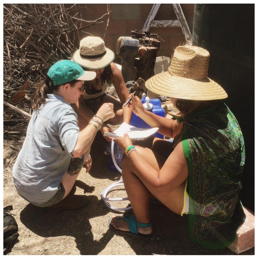
Figure 2. Water distribution at the water tank

withdrawal from the Paris Climate Accords (which occurred during the project month); indigenous resistance related to the NODAPL movement/encampment; and a locally important water use scandal—Cadiz Inc.'s resurrection of plans to build a pipeline to siphon water from an ancient aquifer to support water needs in coastal CA. However, followers of the site saw the narrative backstory fall away as the heat increased and the daily negotiations of shared space and resources took what little energy remained. In the end, although the diminution of narrative content may have affected the audience experience, it did not inhibit the personal and collective transformations that occurred amongst the women as they enacted their new life circumstances, hour by hour, in this harsh environment.