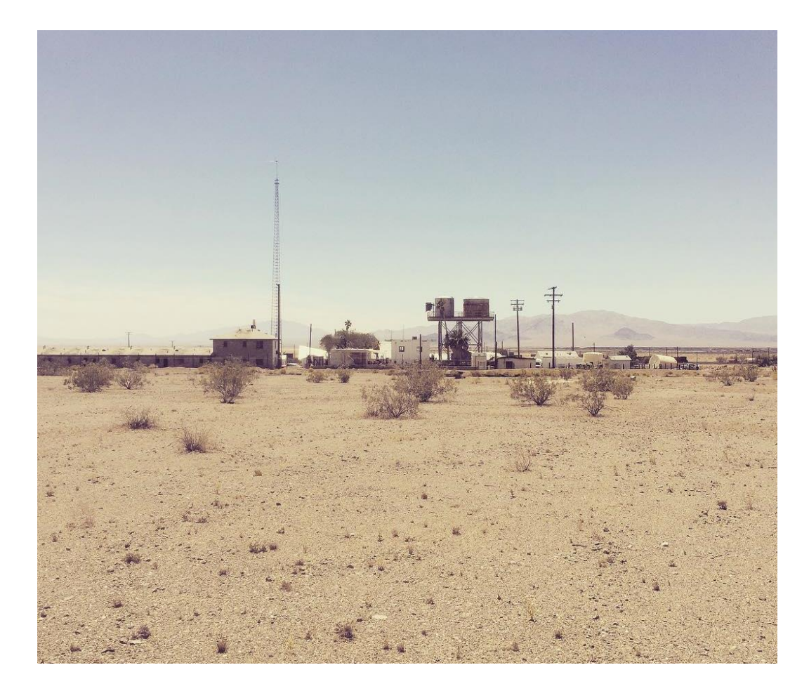
Figure 1. Venue of Drylab 2023

Drylab2023, an experiment in "immersive learning," was conducted from May 13-June 11, 2017. For 30 days, Eight participants lived in a remote desert outpost limited to four gallons of water per person per day to meet all water needs (drinking, cooking, bathing, hygiene, etc.)<sup>1</sup> while subsisting on a water-wise diet. Participants (half artists and half scientists, all in training) were charged to live within a "near future scenario" of water scarcity (2023); modeling how to manage a limited vital resource: fresh water.