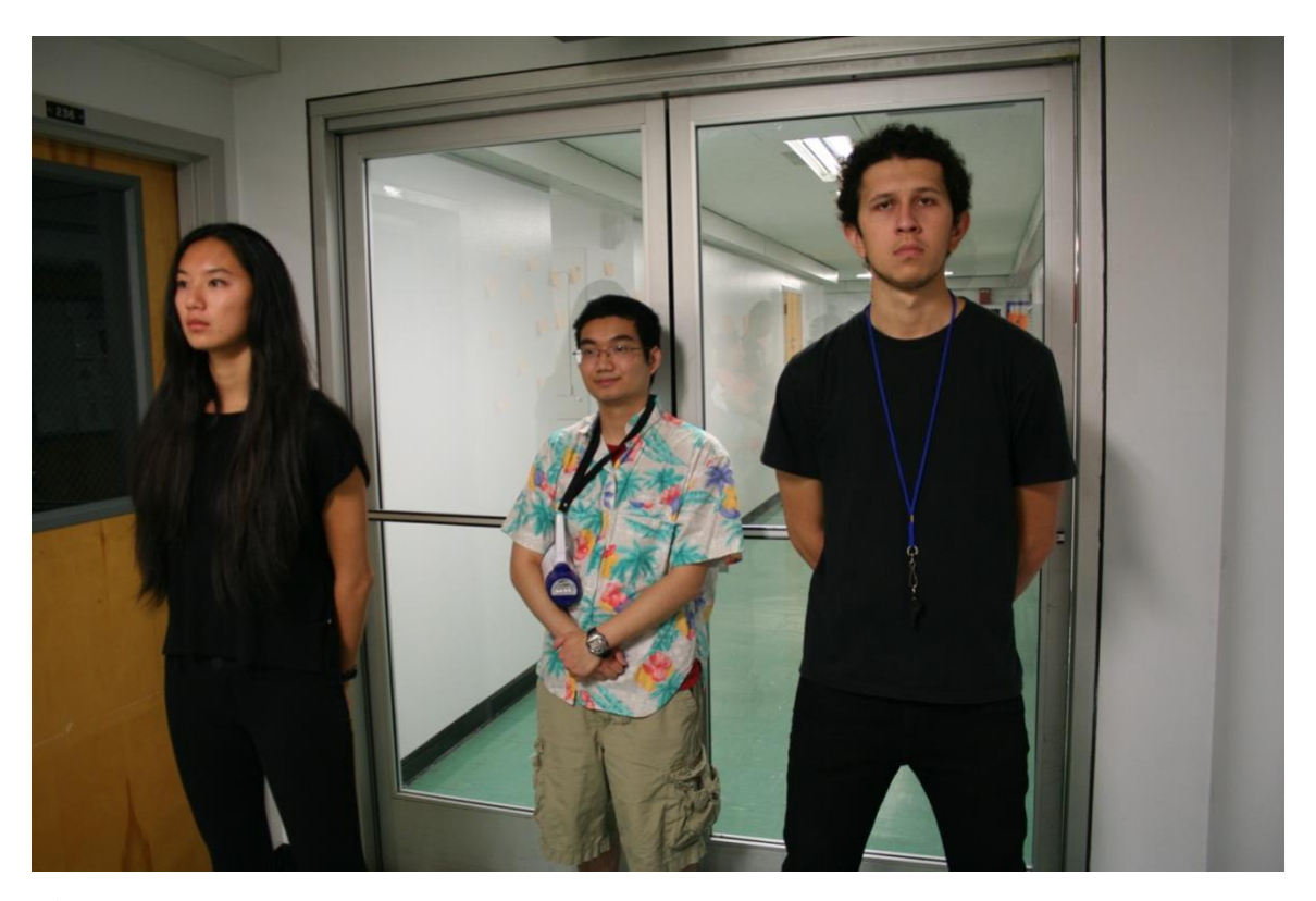
Figure 3. A Walk in Our SHUs: Guards and Tour Guide

Towards the end of the first course, I assembled an hour-long performance composed of solo and group pieces created in class. Some works were incorporated as presented, some were layered together, others were re-assigned to new performers. The performance, which the students titled A Walk in Our SHUs: An Original Performance Exploring the California Prison System , was structured in a prologue and three acts. In one classroom, audience members checked in at a table where four unsmiling Guards asked them a series of personal questions, recording the answers on forms. An ebullient Tour Guide then ushered the group into our own classroom for the first act. The second act was presented in promenade and took place down a long adjoining hallway, where small study rooms set up as cells contained solo acts performing simultaneously. A timeline outlining the history of the hunger strikes ran along with opposite wall. At one end of the hallway a room stood open as an approximation of a SHU cell; at the far end a group of students executed movement sequences against a slide show outlining the Five Core Demands made by the hunger strikers. The Guards paced the hallway, speaking only to remind audience members to look but not step into the study rooms. After roughly