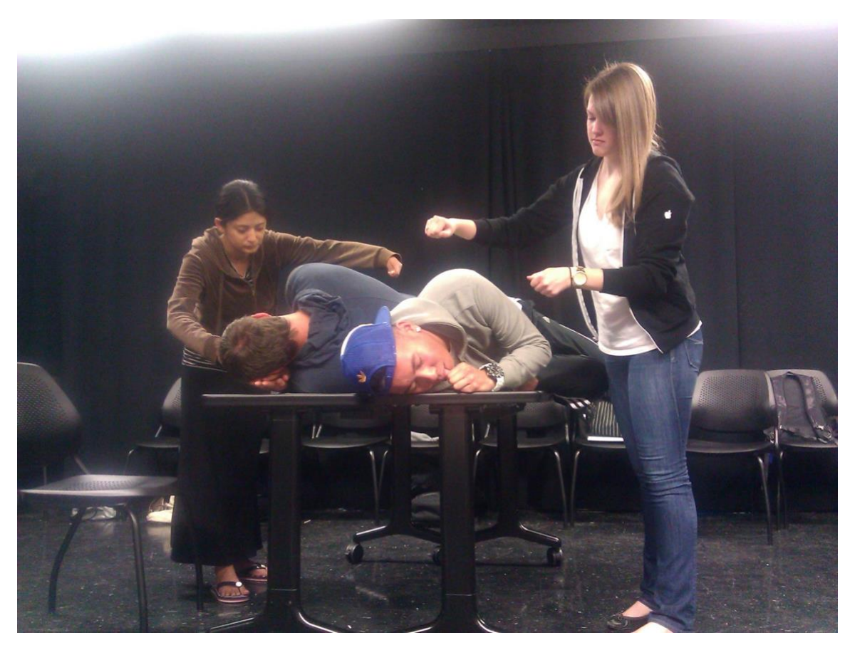
Figure 2. A Walk in Our SHUs: Rehearsal Tableau

disagreed on the length of time it took to hold the position, and as a result ended up posing during different intervals which didn't convey the message properly.<sup>20</sup>