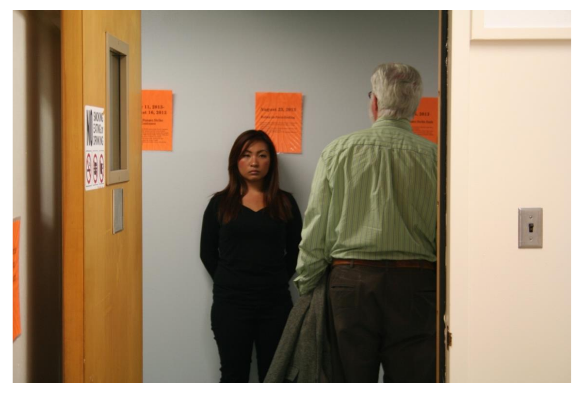
Figure 4. A Walk in Our SHUs: Guard and Audience Member

twenty minutes of exploration, the Tour Guide shepherded the group back to the classroom where the chairs had been moved into a semi-circle for the final act.