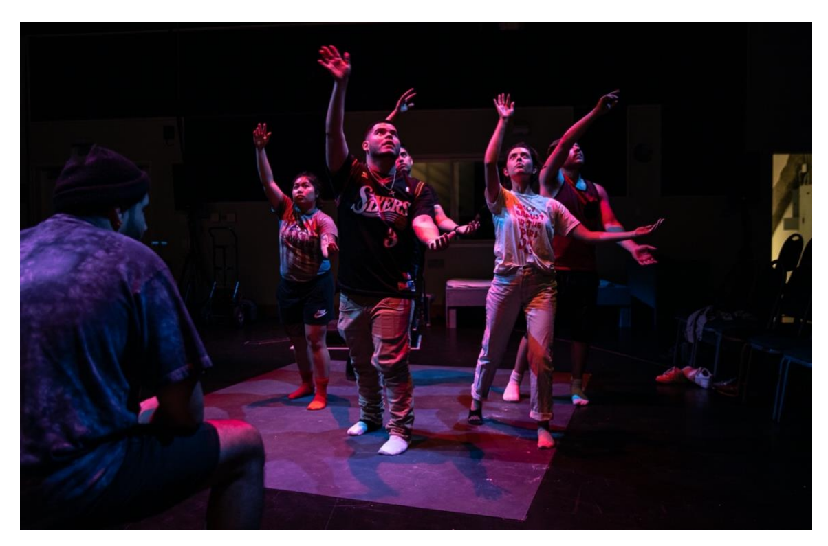
Figure 1. Dance rehearsal for See You in My Dreams , photo by © Peter Merts.

In addition to articulating the value of embodied and experiential learning, students also seemed aware of its challenges and limitations. Of the solitary activity one student wrote: